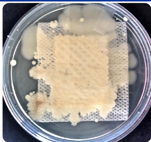
* Microbiological contamination of Commercially available tapes